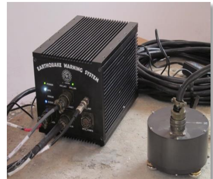
SSN installed at one of the field stations

SSNs are installed at a number of identified field stations depending upon geographical coverage of vital installation