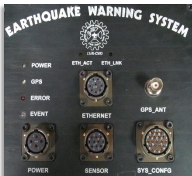
Front panel of the developed SSN

SSNs are installed at a number of identified field stations depending upon geographical coverage of vital installation